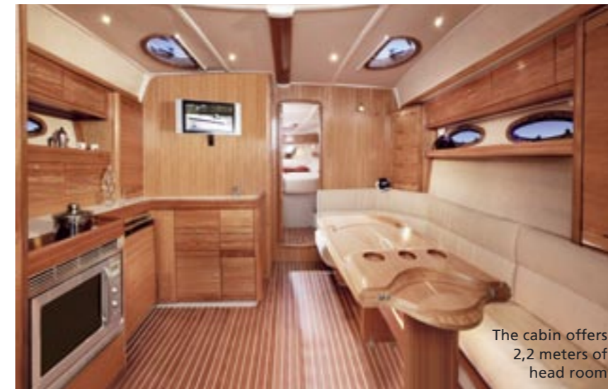
The cabin offers 2,2 meters of head room

The interior of the boat is huge, with a maximum standing room of 2,20 metres. This adds even further to the volume of space in the cabins, as previously mentioned. The wood work offers that trade mark Bavaria finish. One of the problems Bavaria has